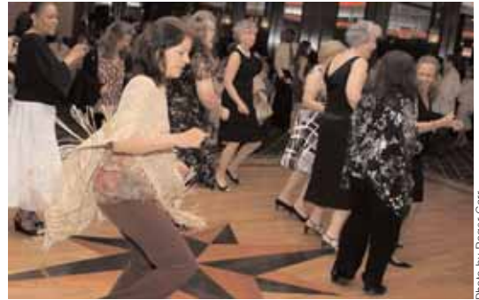
Guests dance at the Spring Gala, which benefits AHRC's elementary and middle/high schools in Brooklyn.