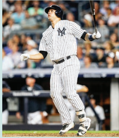
Gary Sanchez

Victor Cruz is a Pro Bowl wide receiver for the New York Giants. He helped lead the club to victory in Super Bowl XLVI. He founded the Victor Cruz Foundation, which furthers