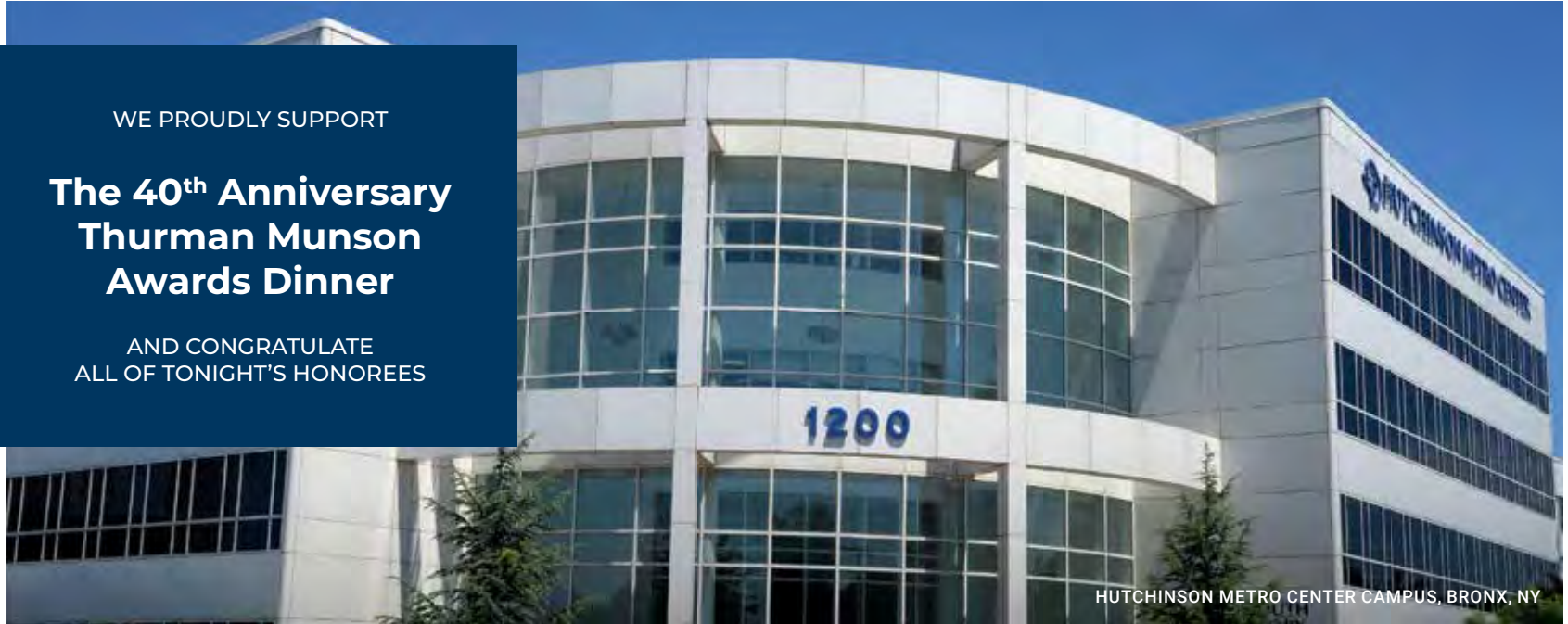
HUTCHINSON METRO CENTER CAMPUS, BRONX, NY

AND CONGRATULATE ALL OF TONIGHT'S HONOREES